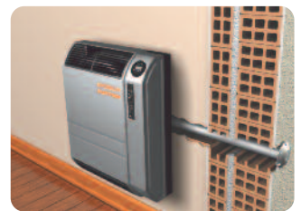
Wall Separate Pipes