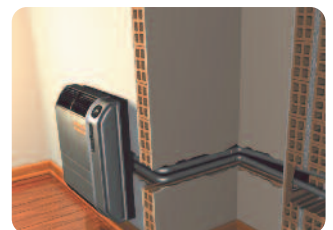
Wall/Roof Separate Pipes